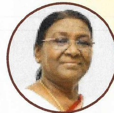
Smt. Droupadi Murmu Hon'ble President of India