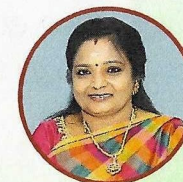
Dr. (Smt.) TAMILISAI SOUNDARARAJAN Governor of Telangana & Lt. Governor of Puducherry