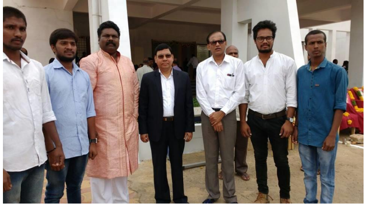
On June 2 2018 Telangana State formation day celebrations at our Palamuru University Mahabubnagar